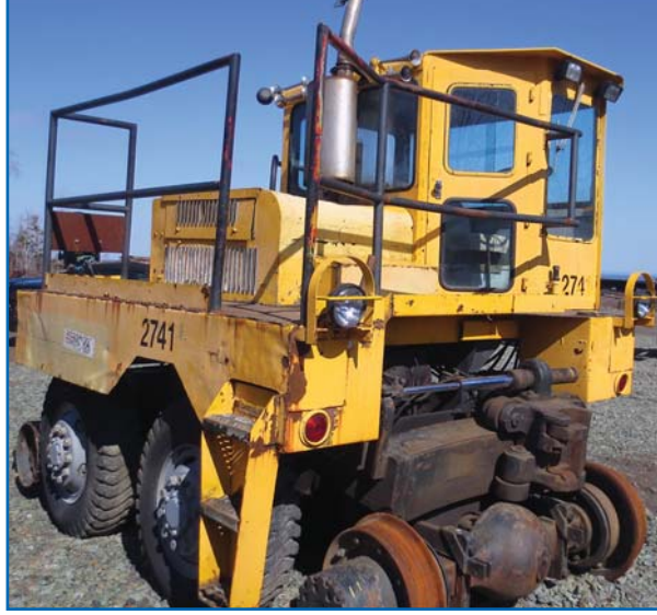
TRACKMOBILE 9TM RAIL SHUNT CAR