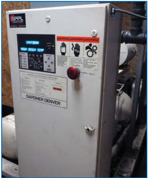
GARDNER DENVER 100HP ROTARY SCREW AC