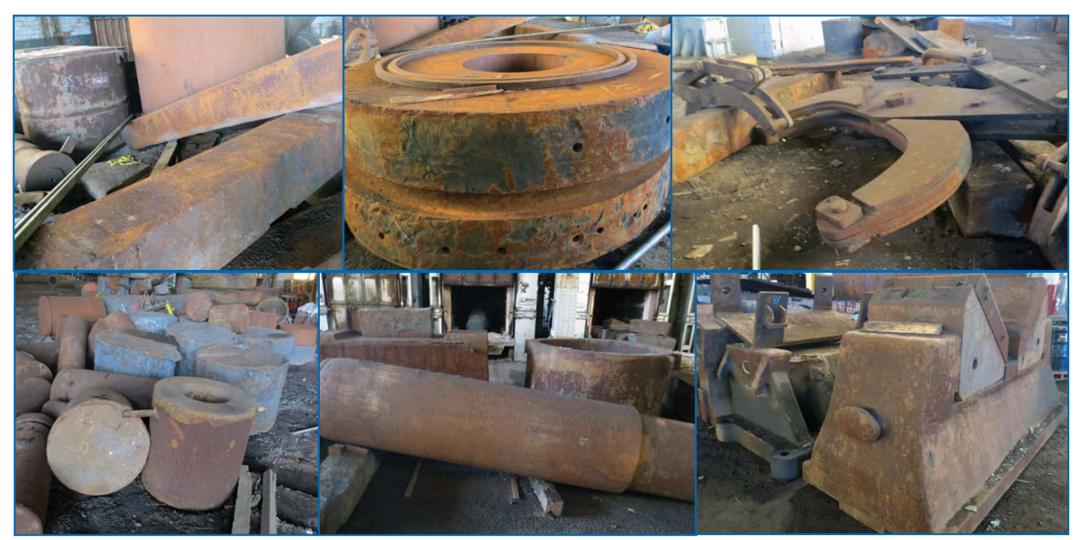
Large Qty. Of Material To Include 4130, 4140, 1030, 1045, Lf2, Cast And Carbon Steel, Copper And More Consisting Of: Chip Bins, Press Pumps, Headers, Reducers, Clocks, Rollers And Misc. Scrap Steel