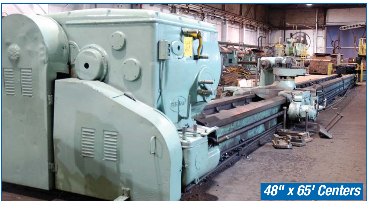
BERTRAM HEAVY DUTY ENGINE LATHE