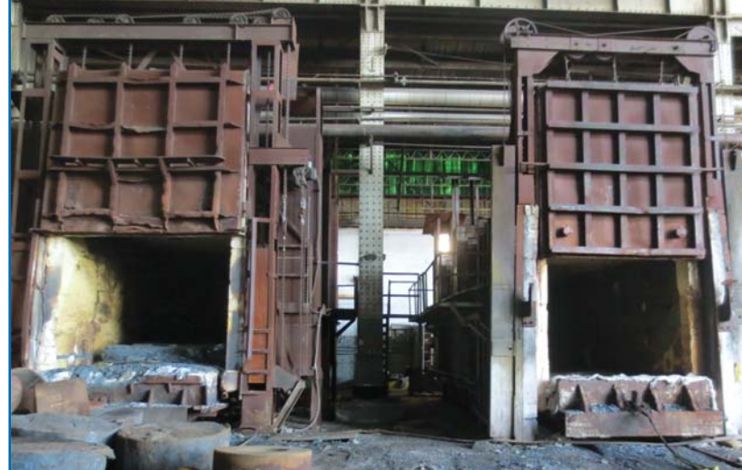
(5) INGOT TONG HANDLING ATTACHMENTS