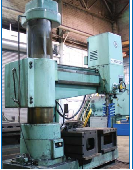
H.CEGIELSKI GRV554 RADIAL ARM DRILL