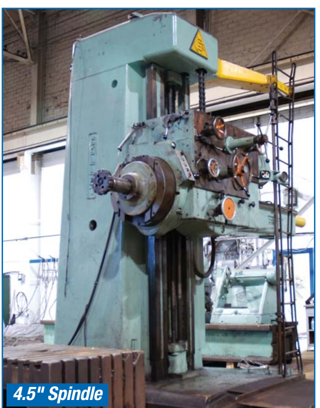
68" x 120"

NORTHERN 30 ton overhead bridge crane with 76' span, double girder, top running, cab control