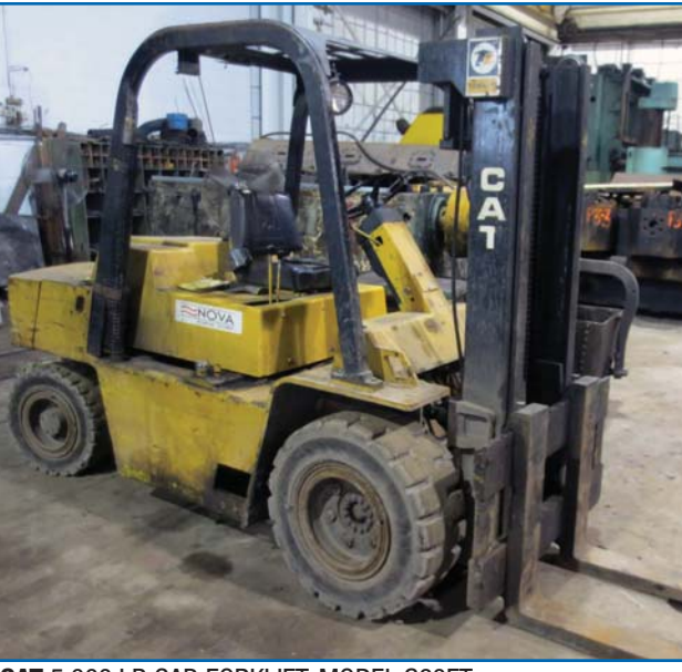
CAT 5,000 LB CAP. FORKLIFT, MODEL S60FT