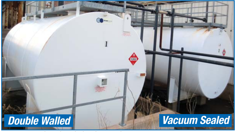
45,000 LITER CAPACITY STORAGE TANKS